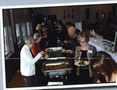
Our intimate group listens intently to the presentations and are rewarded with a buffet style meal, complete with tacos, Mexican rice and chicken and dessert squares.